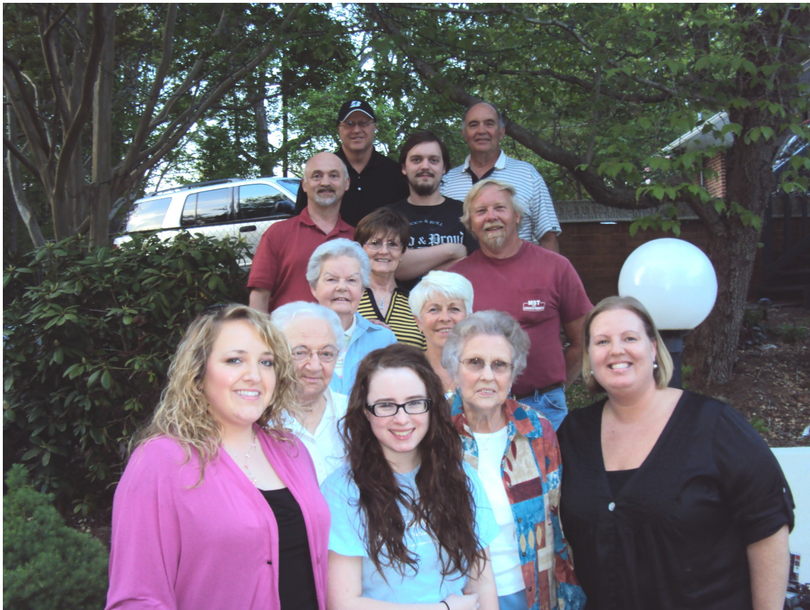
The Mt. Zion Choir Cookout