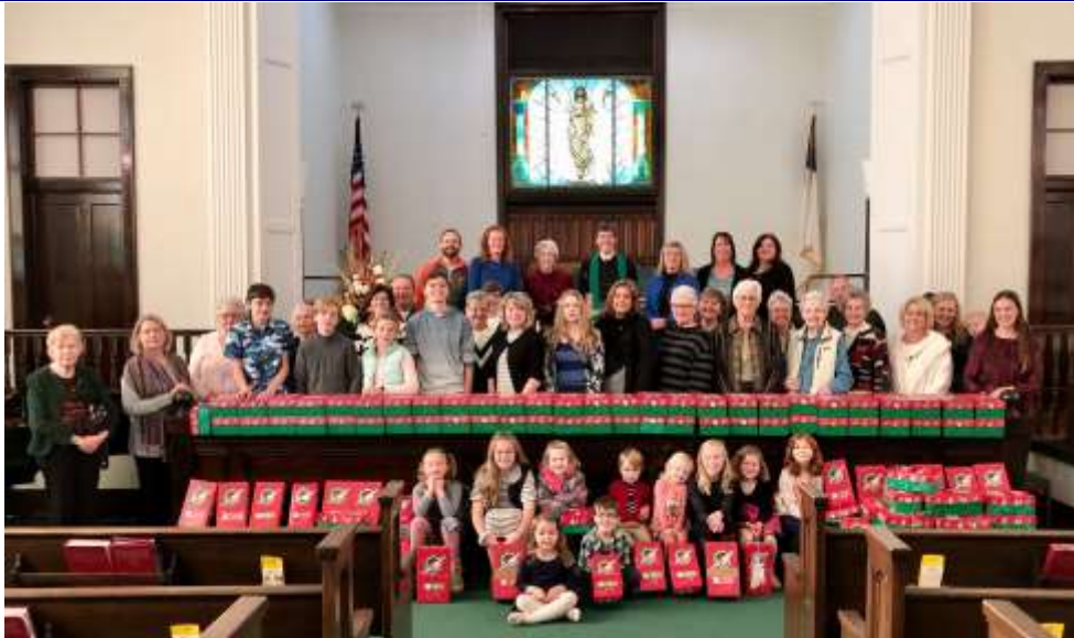
Together we filled 120 shoeboxes. Way to go, Mt. Zion!